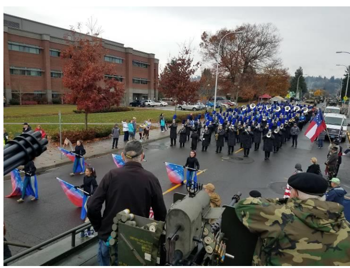
Marching bands from as far as Medford Oregon Note our working Honeywell!! Wish we had some live rounds