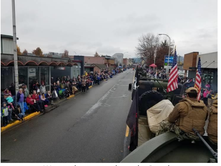
We saw large crowds on the Parade